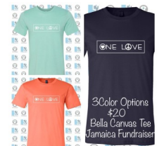
3Color Options $20 Bella Canvas Tee Jamaica Fundraiser

taking orders for their "One Love" T-shirt $20 each! Please show your support and order one!